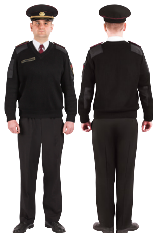
FIREFIGHTER AND INSPECTOR