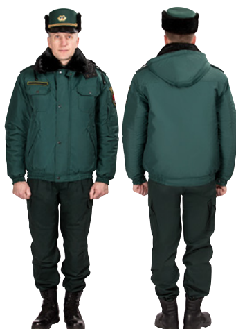
STATE BORDER GUARD