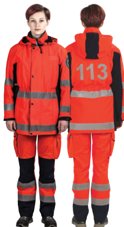
STATE EMERGENCY MEDICAL SERVICE WORKER